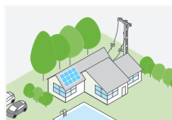
Residential grid-tie solar with backup power